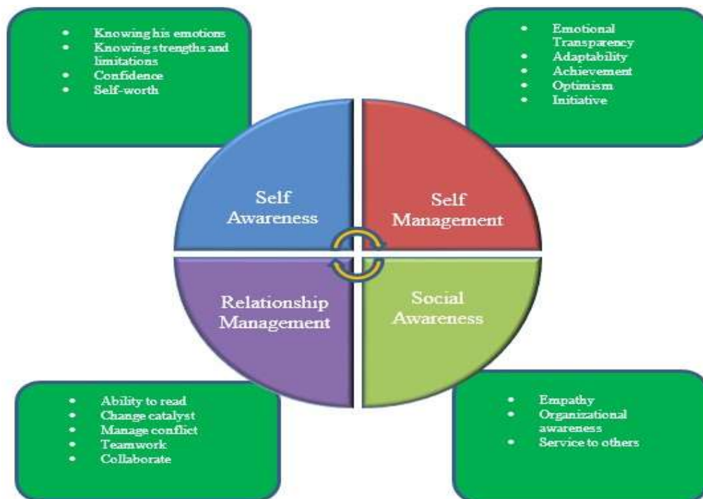
Figure 1. The Boyatzis and Goleman’s Emotional Intelligence Framework

In using this framework, the CME tried to categorize the components of the instrument used in assessing the performance of the deck and engine cadets. It was found out that the components fits on the four competencies introduced by the framework. Thus, they consider the emotional intelligence framework as a strong grounding for this study. The framework is illustrated in the Figure 1.